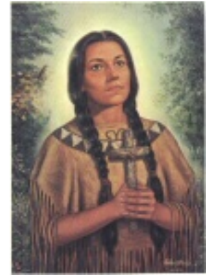
Canadian Saints and Saints to come