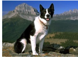
Kuma - the bear dog

So your out on a hike in the woods and it's a beautiful fall day. You're walking along with not a care in the world... All of a sudden you find that you are being watched...it's really big, brown and it is not very happy to see you...what do you do next?